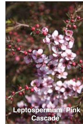
Leptospermum 'Pink Cascade'