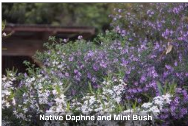
Native Daphne and Mint Bush